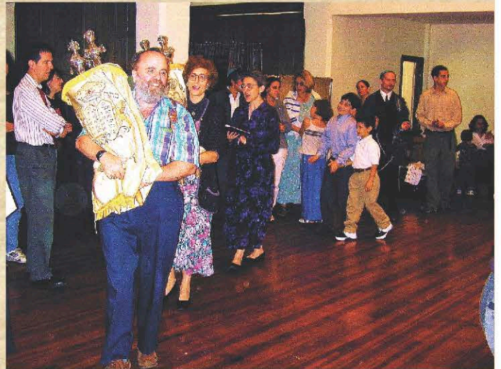
Hakafah – Joyfully walking with the Torah during the holiday of Simchas

We are delighted to welcome you as we celebrate 75 years in Northern Manhattan and plan for more.