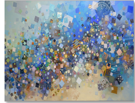
Water Connects The Seven Seas 60"x36"