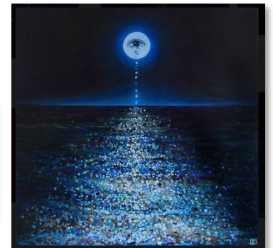
Quando la luna llora, 2010, 40"x40"