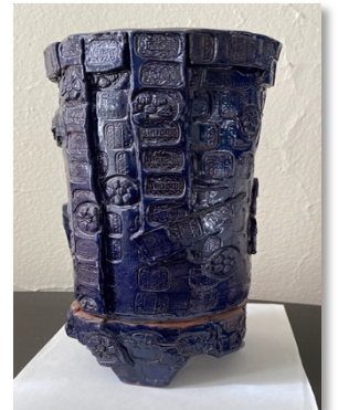
Pottery Vase – 13" x 6"