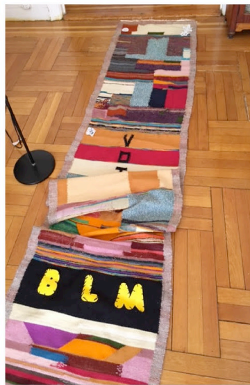
Life Goes On 17 feet x 2 feet 5 inches varied fibers

Please leave a comment about my weavings. You can find others at: www.estarweaver.com Please contact me at: starcny@aol.com