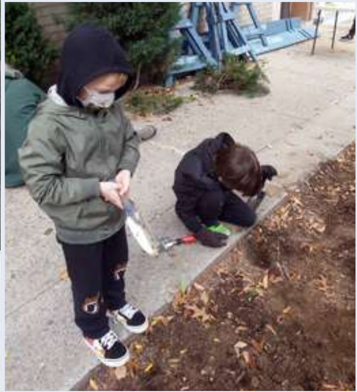
Two of our very young members doing their part to help out.