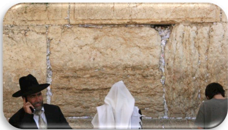
Israel – Wailing Wall, 2009

My photos have appeared on the covers of The Messenger – the newsletter of Beth Am, The People's Temple – where I am its editor.