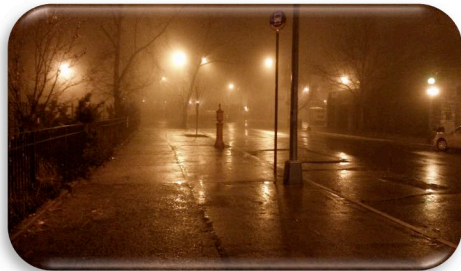
Fort Washington Avenue, 2014

I've been interested in photography since I was twelve years old. At that time there was only black and white film and I had my own darkroom with a good enlarger. I loved learning the mechanical and chemical manipulations of film developing and printing to achieve results that everyone's cell phone can now do in an instant.