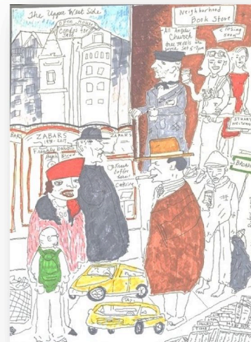
Dusk on the Upper West Side! Inspired by George Grosz. 2017, Pen, ink, and marker on watercolor block paper. 10"x14" framed

SATURDAY March 7th Noon – 1:30 PM (begin with Sabbath Services at 10 AM)