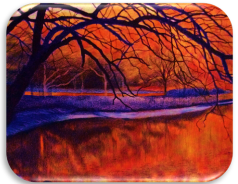
Red December Skies