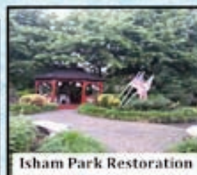
Isham Park Restoration