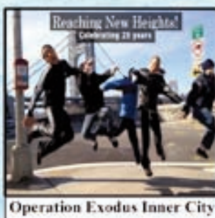
Operation Exodus Inner City