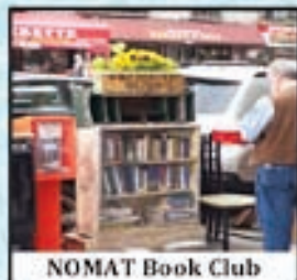
NOMAT Book Club